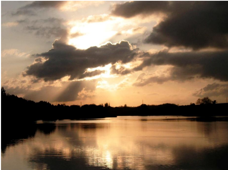
Cransley reservoir in November

CPRE, in partnership with the National Association of Local Councils (NALC), was one of four successful bidders in the DCLG's "Supporting Communities in Planning" scheme. As a result, we are now funded to provide advice and guidance on the planning system to our members, parish councillors and interested members of the public.