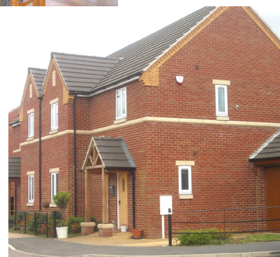
Pullman Close, Rushton