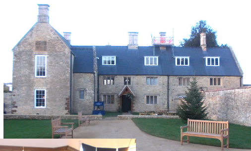
Chester House Estate Little Irchester

This competition is held every two years, alternating with our Community Award Scheme, which we will run again in 2024. The 2021 Town & Country Awards winners were: