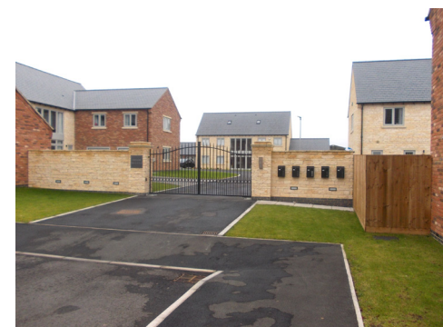
Coles Close, Little Harrowden