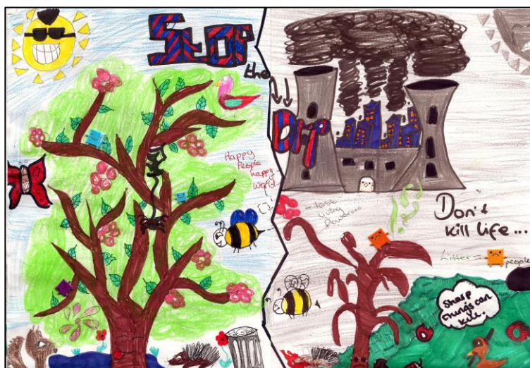
Year 7 Individual First Prize